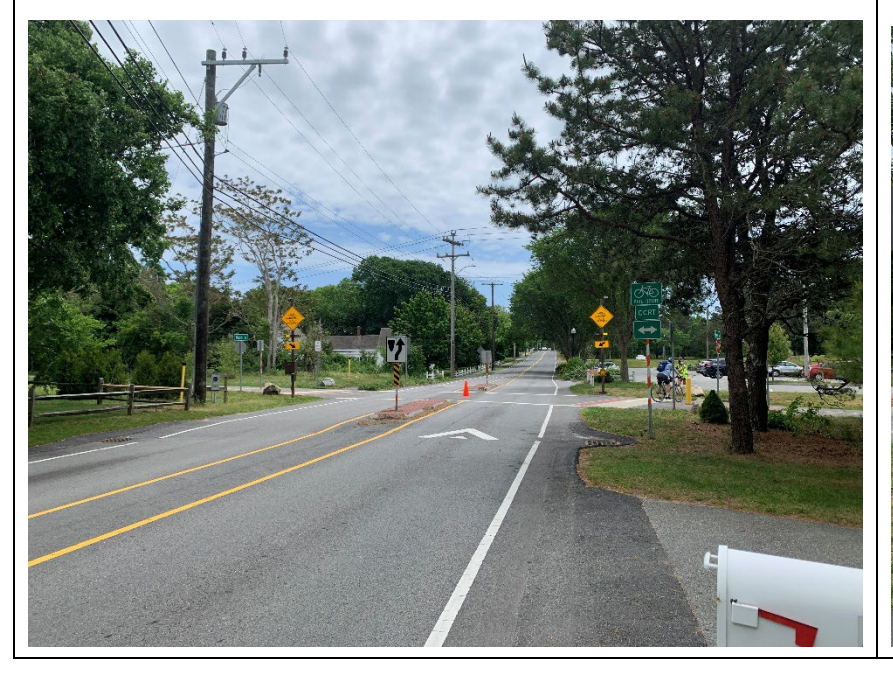
Figure 199: East-Facing View of Path Crossing. Medians Provide a Place for Bicyclists and Pedestrians to Make 2-Stage Crossings

Figure 198: Bike Trail Crossing Signs, RRFBs, Raised Crosswalk, and Clear Sightlines Make Crossing Highly Visible